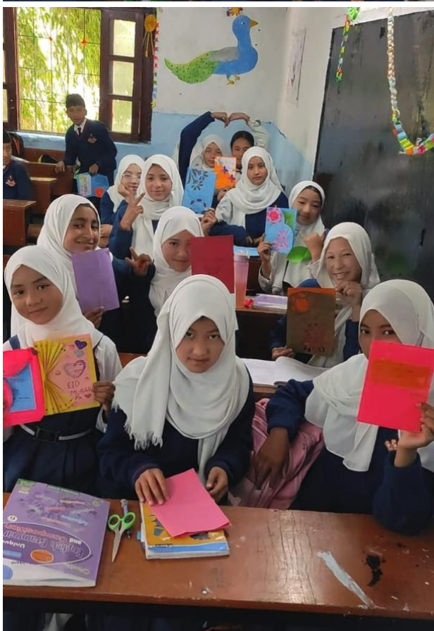
Celebrating Culture and Wellness A joyful mix of Eid, Yoga Day, and mindful moments of connection and reflection.