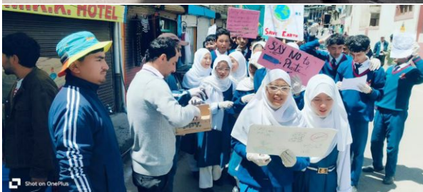
United for the Earth Students lead eco-initiatives