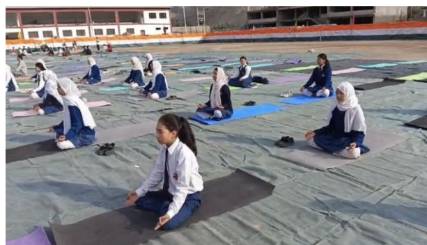
Celebrating Culture and Wellness