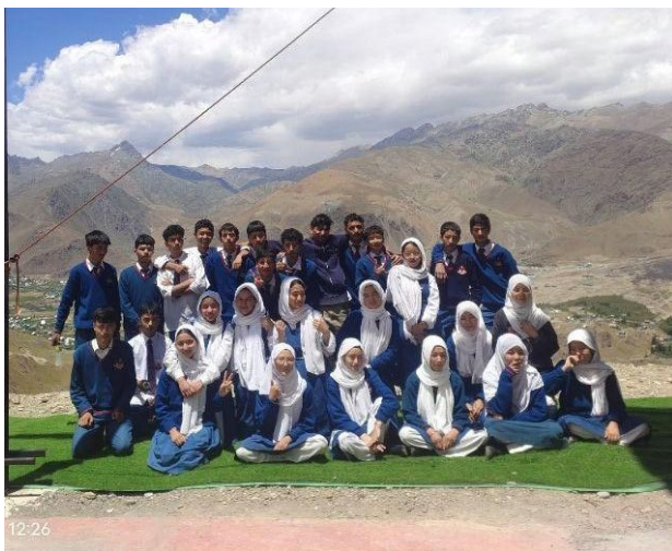
Honouring History, Celebrating Expression