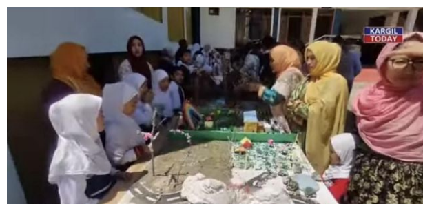
Innovation in Action – Students showcase scientific brilliance

Students showcased their scientific innovation during the Annual Science and SAT Exhibition held on Annual Day. Projects on technology, biology, and environmental studies drew appreciation from visiting dignitaries, parents, and faculty.