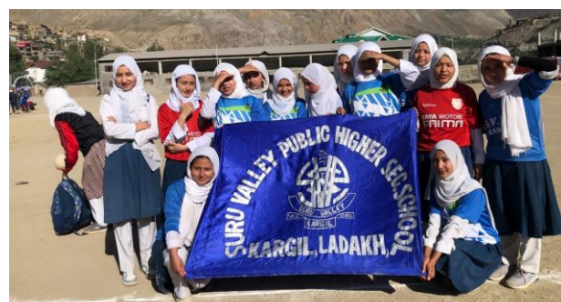
Champions in the Making – Sportsmanship and Spirit at SVPHSS