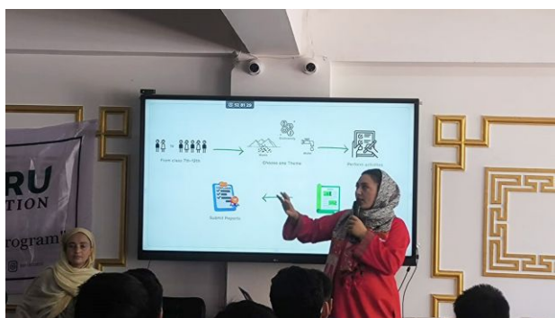
Sowing Seeds of Sustainability Students engaged in hands-on environmental learning with Navikru Foundation.

Two impactful sessions under the Wipro Earthian Program were held with Navikru Foundation, emphasizing environmental responsibility, water conservation, and sustainable development.