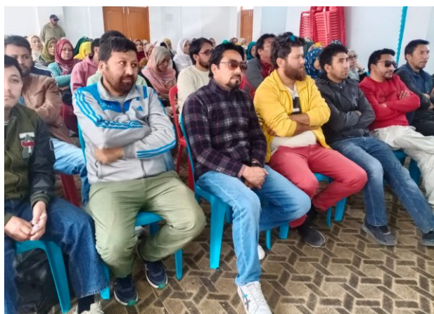
'Guiding Young Futures Parents and students explore pathways in innovation and agri-tech with expert insights.