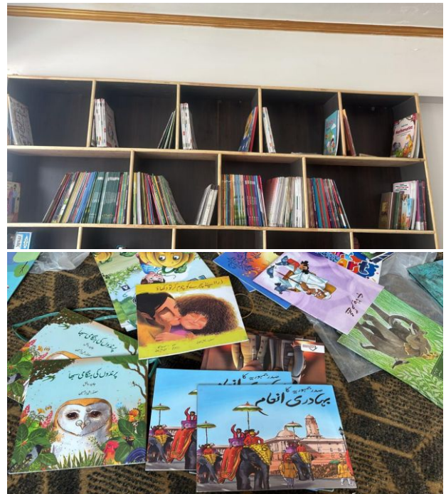
Fueling Futures Learning, Reading, and Guiding