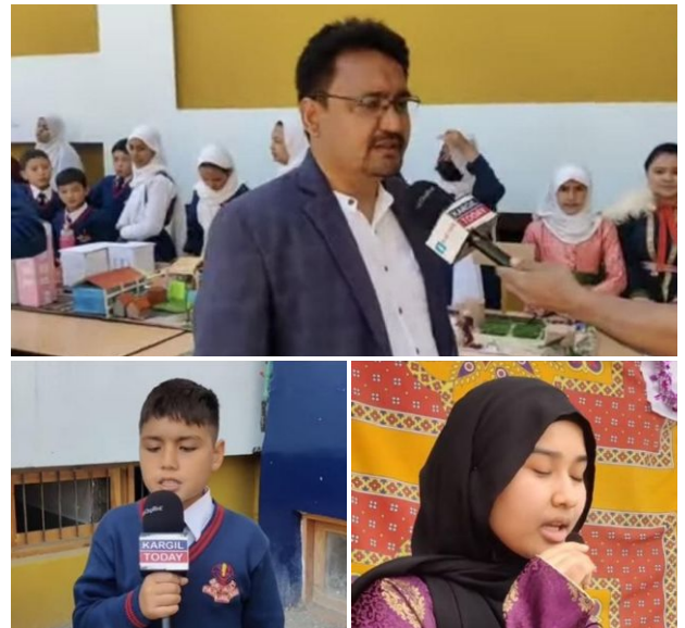
Celebrating 43 Years of Legacy and Learning

Our school proudly celebrated its 43rd Foundation Day , paying tribute to a legacy of educational excellence and community growth. Under the theme " Honouring the Past, Inspiring the Future ", the day was filled with pride, reflection, and renewed commitment to empowering future generations.