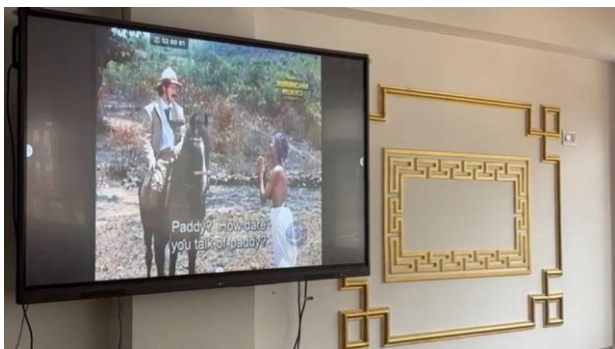
Honouring History, Celebrating Expression From Kargil Vijay Diwas to Moharram assemblies and theatre workshops, students connect deeply with values and voices.