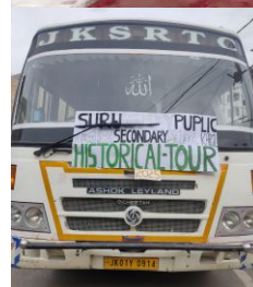
Connecting with Culture and Courage – Students explore heritage at the Munshi Habibullah Museum and reflect on bravery at Drass."