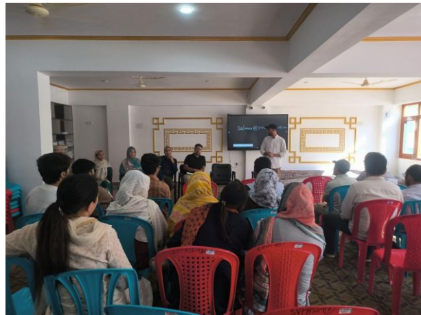
Together for Every Child Parents and teachers unite to nurture student growth and academic support.