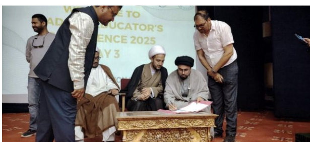
Building Bridges Academic Collaborations for Growth