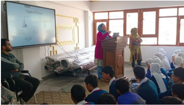
Mental Health Matters – Wellness Workshop in progress

In collaboration with Wipro Foundation , a session on " Stress and Stress Management " was conducted, helping students understand the importance of mental health and strategies for emotional resilience.